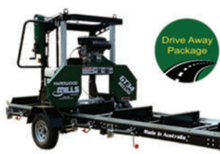
GT34 Deluxe Diesel Portable Sawmill (Powered by YANMAR)