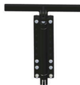
Hydraulic Toe Board Attachment