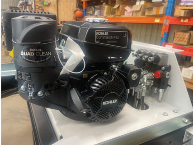
Hydraulic Pump with Control Bank

Hydraulics can be fitted and retrofitted to all models