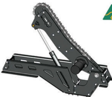
Hydraulic Log Turner