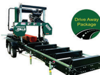
GT40 Ultra Portable Sawmill (Powered by YANMAR)