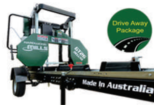
GT26 Deluxe Portable Sawmill (Powered by YANMAR)