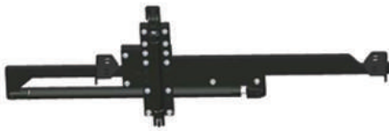
Hydraulic Log Clamping System (Set of 2 log rests & 1 clamp)