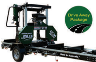
GT34 Deluxe Portable Sawmill