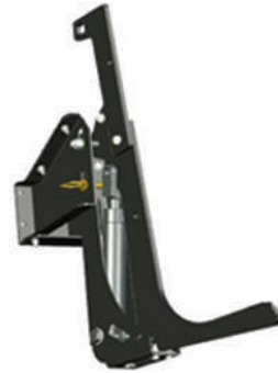
Hydraulic Log Loader (Lifts 3 tonnes)