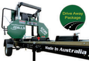
GT26 Deluxe Portable Sawmill

(pick up from West Gosford, NSW warehouse only)